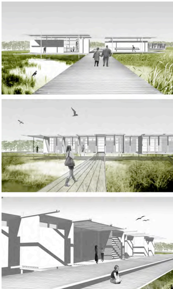
Figure 3. Paradise Creek Park (Beth Kahley)

The Paradise Creek studio is one in a series of core studios where I worked with graduate students to develop fundamental design skills