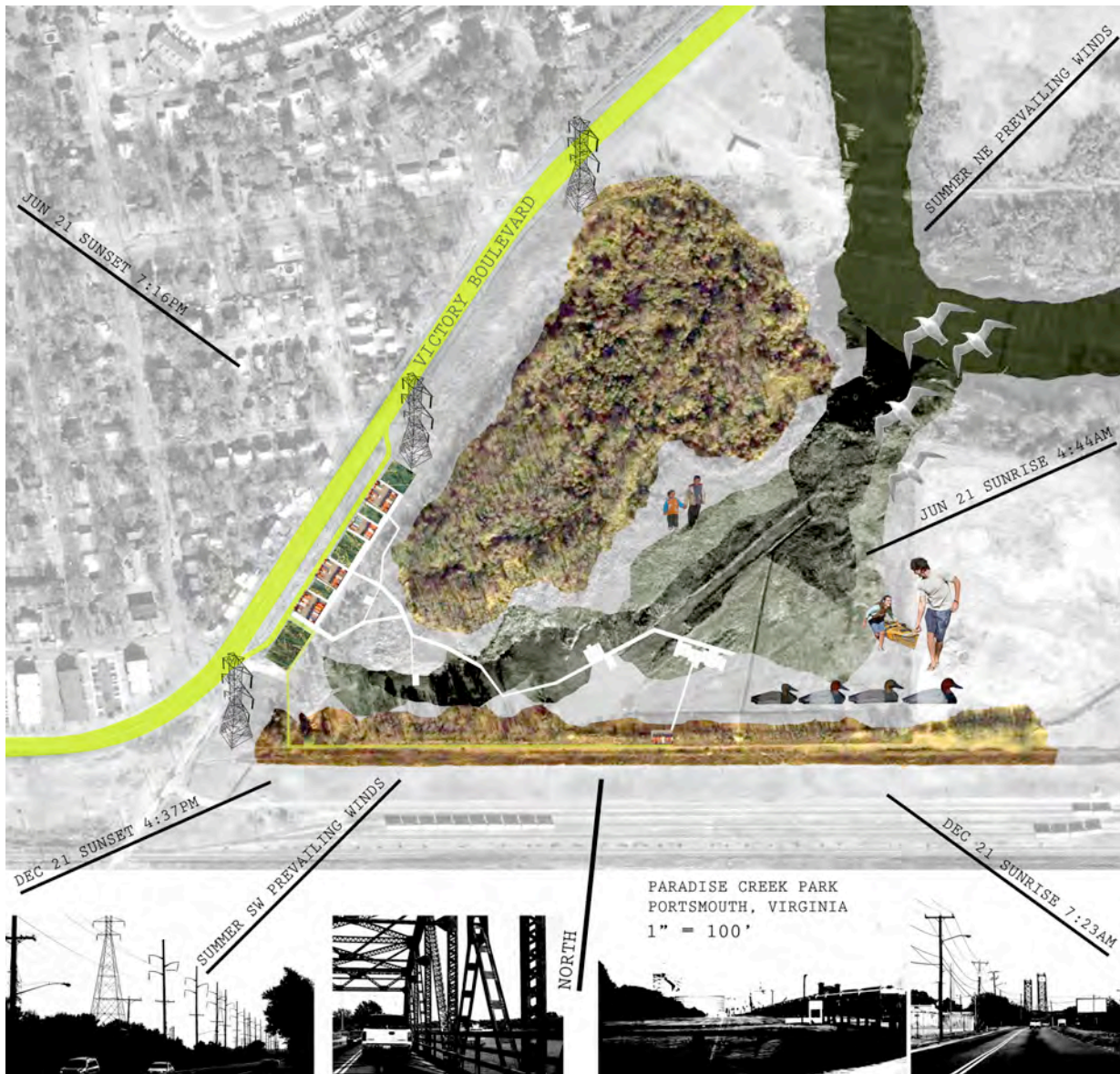
Figure 2. Paradise Creek Park (Beth Kahley)