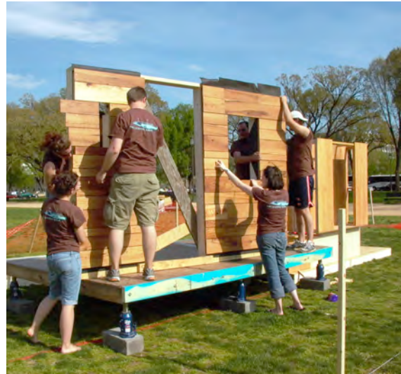
Figure 1. Learning Barge team at the 2007 US EPA P3 competition

Diverging from the typical studio pedagogy, student teams researched and analyzed a broad range of important issues, then situated their intentions and design proposals within a particular place and a larger set of ethical concerns by writing a series of individual project statements. They developed a mode of inquiry that bridges the gap from both sides—through critical thinking and critical making. This conundrum, experienced in the lab, library and studio, is not new in educational theory. In “Researching for Democracy and Democratizing Research,” two professors in Law and Sociology study problems inherent in research conducted in academic isolation and analyze methods for a more civically engaged form of research, including participatory action research, collaborative inquiry and practitioner research. 4 The “Research Design Build” methodology of the Paradise Creek and Learning Barge projects share a commitment to participate in civic life, “struggle with the messy interconnectedness of real-world problems” 5 and instill a sense of ethical responsibility.